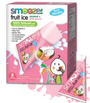
Display Box 65ml x 8 packs