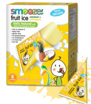
Display Box 65ml x 8 packs