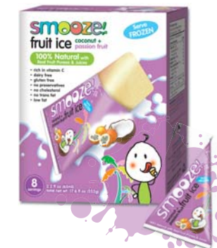
Display Box 65ml x 8 packs