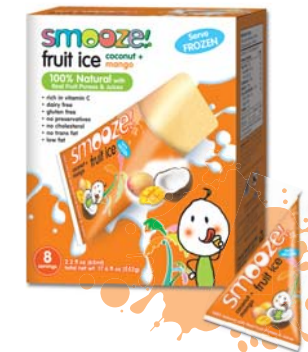
Display Box 65ml x 8 packs